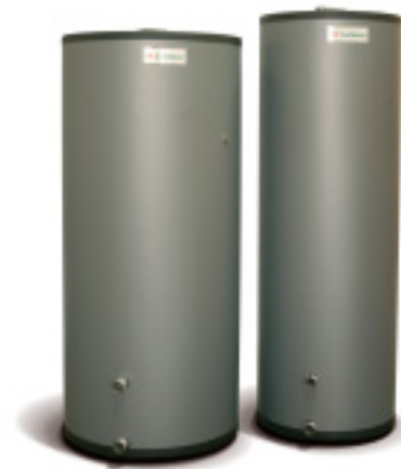
SST 300 and 450 Stainless steel storage tanks with patented cold water injection design