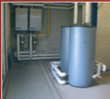
Two EcoForce wall-hung models with two SST stainless steel storage tanks

Lochinvar® High Efficiency Water Heaters and Boilers